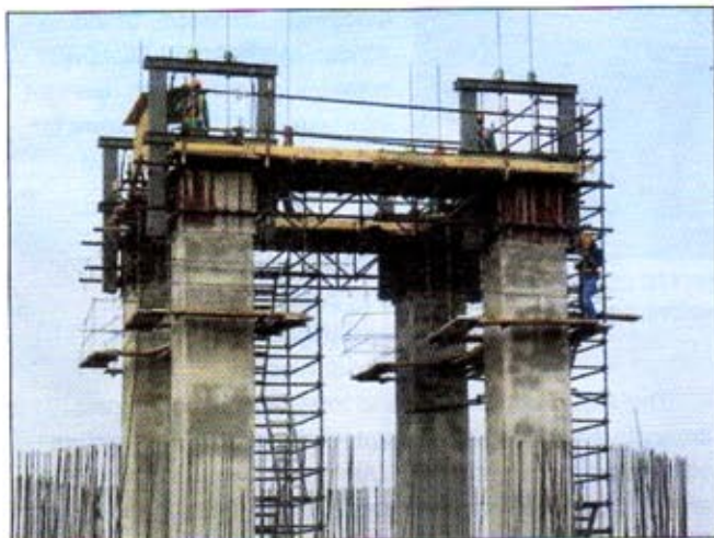
Slip form construction of columns