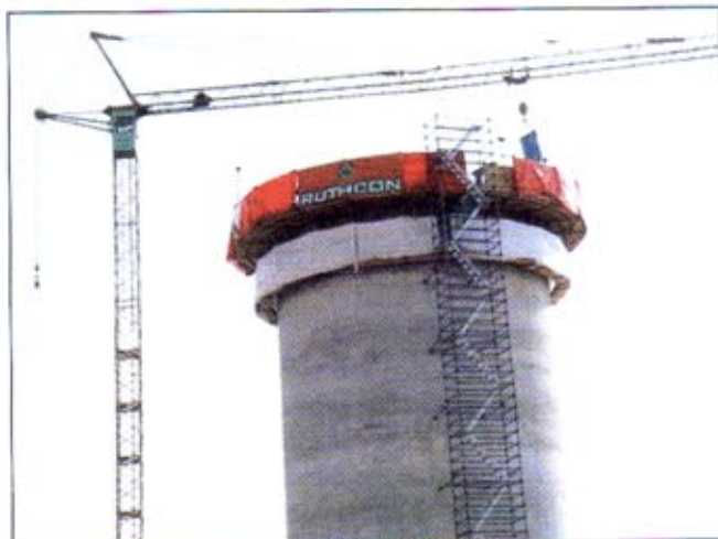
Silo 1 nears completion